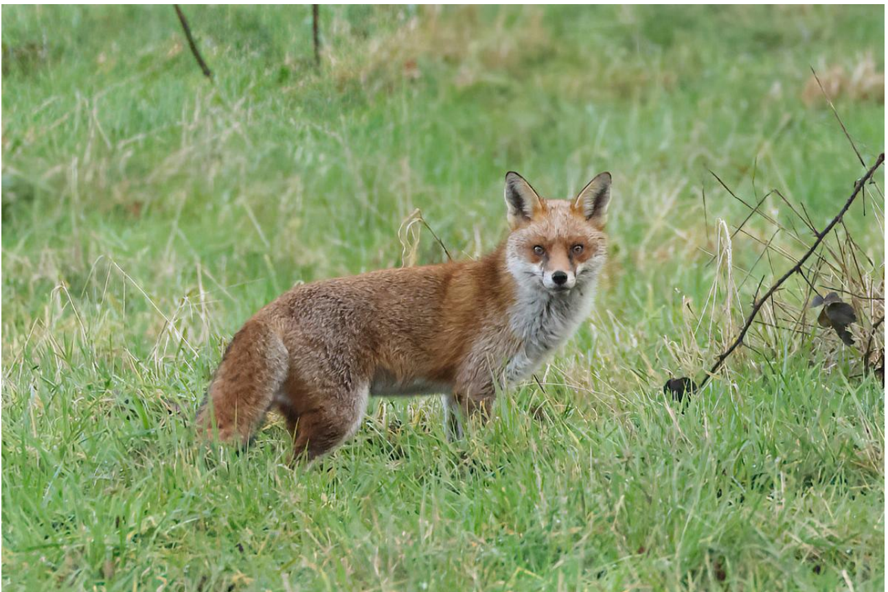
Fox near the Grassy Patch